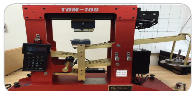
The TDM100 test machine measures cut resistance of glove fabric to a sliding blade.

It is important to note also that, although the EN388 standard has been adopted outside of the EU, including New Zealand and Australia, these recent changes only apply within the EU until the new standard has been formally adopted by other countries.